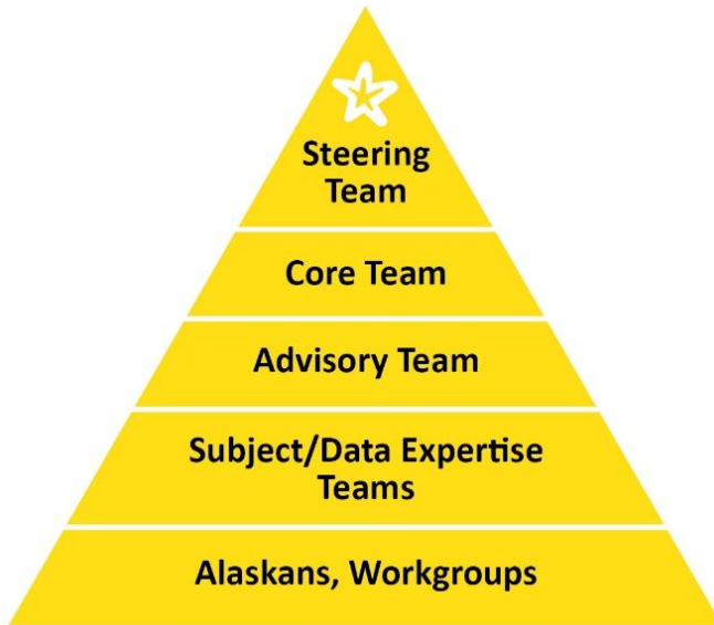
Figure 2 Healthy Alaskans Structure

The Advisory Team is made up of approximately 40 professionals from the broader public health arena in Alaska who are subject matter experts in topics that span the entire spectrum of public health services and functions. These include nonprofit, state, Tribal, private and other entities working in areas such as environmental health, injury prevention, mental health, housing, chronic disease and other public health areas. The Advisory Team uses their professional expertise to make recommendations to the Core Team regarding objectives, strategies, implementation and process. The Advisory Team members also serve as active champions of Healthy Alaskans, promoting it among their networks and colleagues, and aligning their work with Healthy Alaskans goals as appropriate.